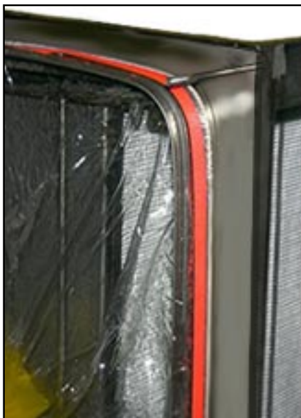
PVC Change-Out Bag in place with shock cord on the bag-in/bag-out port and orange nylon security strap buckled with D-ring and fastened with Velcro